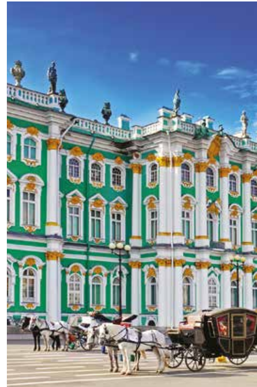
Winter Palace Square and the Hermitage Museum

Our group size is limited to a maximum of 25 guests per departure and Julia will be looking after all your sightseeing, theatre and dining arrangements. Being part of such a small party you will be able to take full advantage of our host's in-depth knowledge of her home city and because of the central location you will be able to walk to many of the most notable sights such as the Hermitage, Russian Museum, Palace Square, St Isaac's Cathedral and the Nevsky Prospekt. Our stay will also include a number of visits to historic palaces, both within the city and in the surrounding countryside.