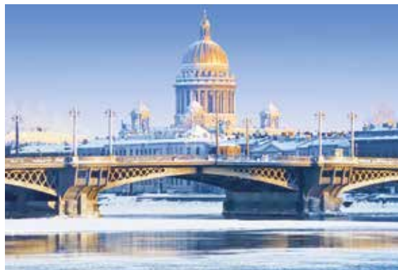
St Isaac's Cathedral