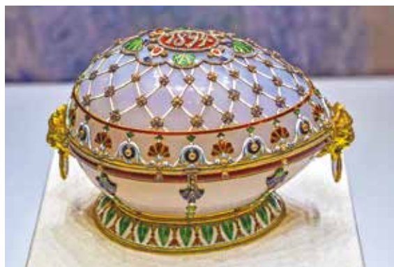
Fabergé Easter Egg from the Fabergé Museum