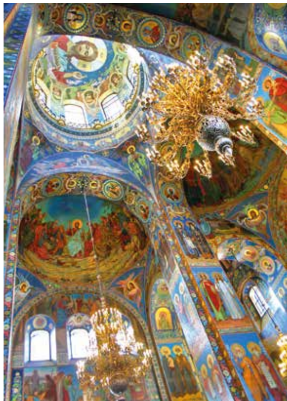
Interior of the Church of the Saviour on Spilled Blood, St Petersburg

wax. After lunch at Sadko we return to our hotel and enjoy an afternoon at leisure. In the early evening we plan to attend a performance at the Mariinsky Theatre (ballet or opera, schedule permitting). The Mariinsky Theatre was built in 1860 for Alexander II's wife Maria Alexandrovna. Known for many years as The Kirov, its Soviet Era name, the internationally renowned theatre has seen the rise of many Russian stars. Today, it is best known for its ballet and is one of Russia's leading opera houses. Snacks and drinks will be served during the interval. (B, L)